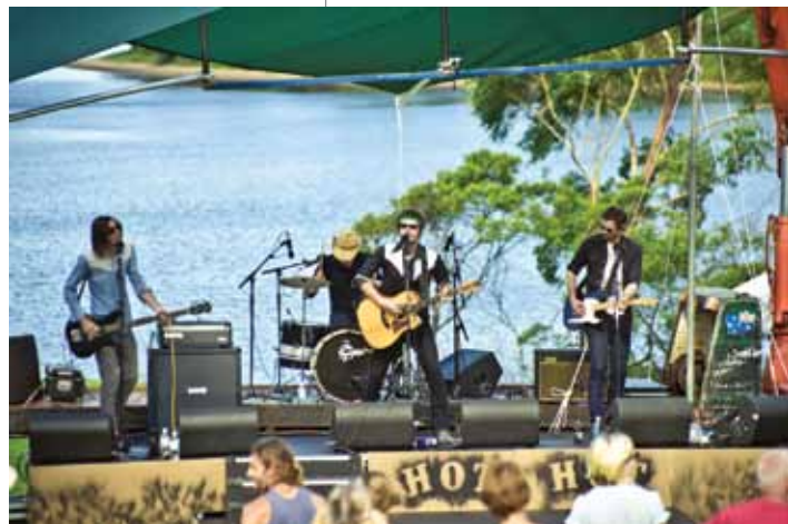
ABOVE | WAGONS PERFORMING AT HOT COUNTRY