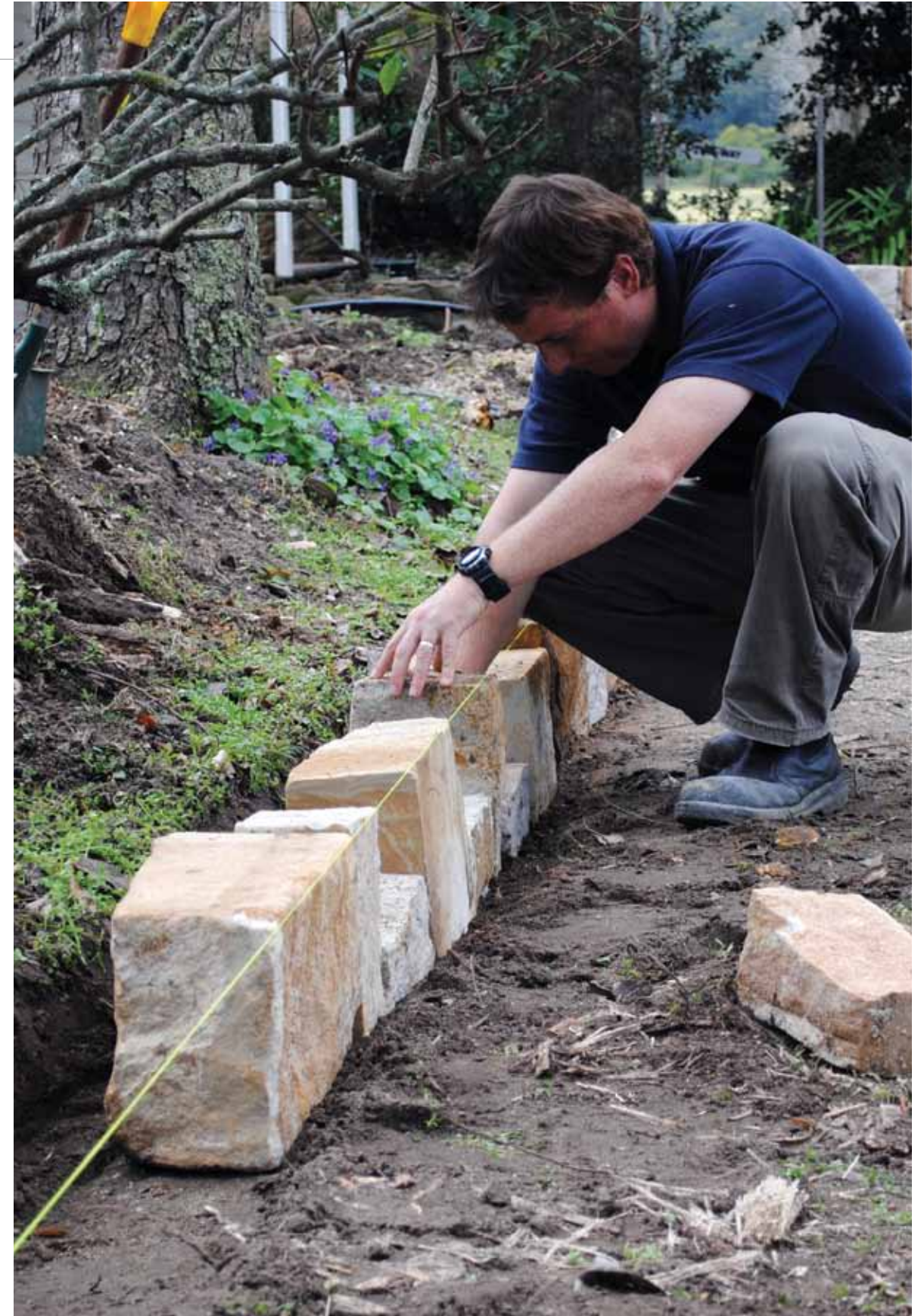
ABOVE | THE BUNDANON ELF. RIGHT | LANDSCAPING IN THE BUNDANON HERITAGE GARDEN

The Total Asset Management Strategy has undergone its annual review and now far better reflects the maintenance requirements of all the sites. New regimes for regularly inspecting and repairing fixtures and fittings have been put in place. A significant project to restore the floor in the Boyd Education Centre, which