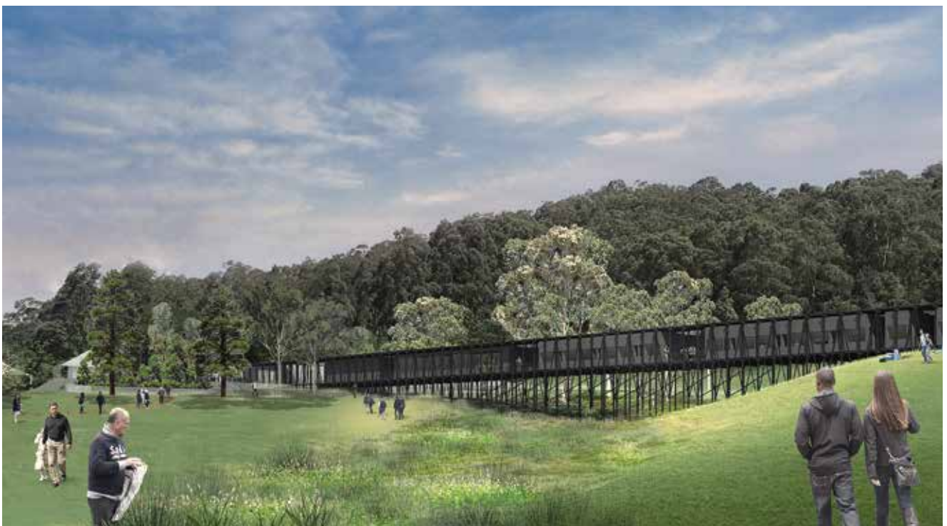
Cover: Shoalhaven River view from Riversdale, Image by Keith Saunders.

Support is being provided for the new $33M facility by the Australian Government ($22M), the NSW Government's Regional Cultural Fund ($8.6M) and private donors.