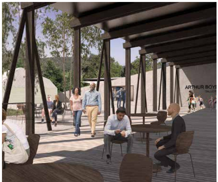
Above: The Arthur Boyd Gallery, Image supplied by KTA; Entrance to the new Gallery from Riversdale café, Image supplied by KTA. Over: Arthur Boyd, Image by Alex Poignant