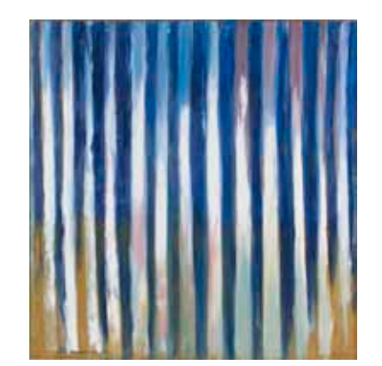
Arthur Boyd, Trees, 1979-80, oil on canvas

The paintings of Arthur in this exhibition directly acknowledge the influence of his father on the content of, and approach to, his wider work. This is seen through direct reference in an important series of paintings on 'The Potter' in the 1960s and 70s, which integrated memories of the family with the anguish of his father's illness and old age into the broader themes of his paintings. Examples are also given of Arthur's reference in later paintings to the motifs in his father's work. The large painting Trees, 1979–80 is a direct reference to the forms of his father Merric's iconic white gums, depicted on Jug with trees, 1942.