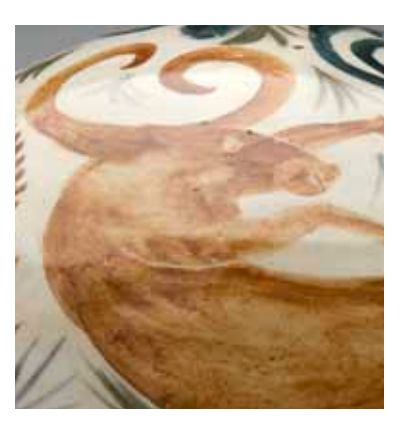
Arthur Boyd, Lidded bowl with ramoxes, 1948, ceramic (detail)

Guides 1, 2 and 3 are suitable for art and design students in years 10, 11 and 12 and focus on the roles of specialists within the exhibition production and design team. Students can explore the roles of the production staff, the curator, the photographers and the designer of the exhibition. Guides 4, 5 and 6 are suitable for visual arts students in years 7 to 10. These are practical classroom activities allowing students to link their own arts practice with themes from the exhibition. Guides 7 and 8 are for students in years K–6 and are practical classroom activities allowing students to explore the subject matter and themes of White guns and ramoxes . A Children's discovery trail is provided for primary school groups and for families visiting the exhibition with young children.