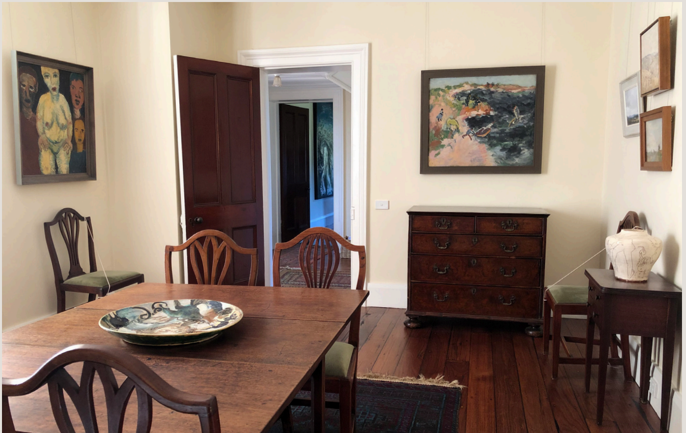
Homestead interiors, 2023.